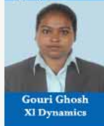
Gouri Ghosh XI Dynamics