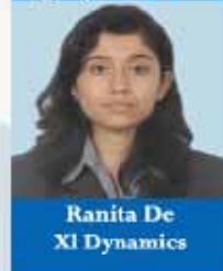
Ranita De XI Dynamics